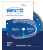
Mexco Diamond Blade product packaging