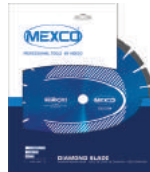
Mexco Diamond Blade product packaging