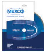
Mexco Diamond Blade product packaging